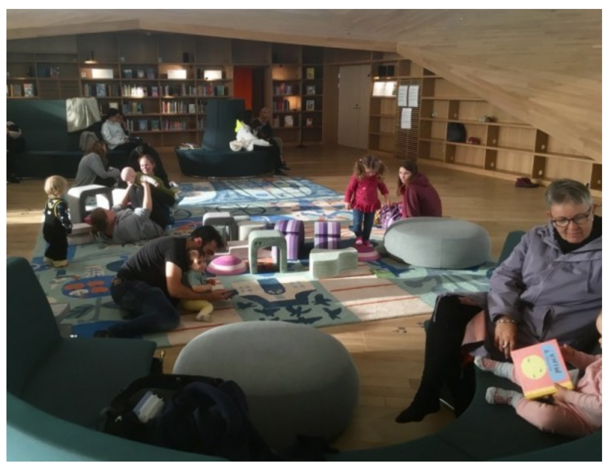
Parents and Children play and reading area of the Oodi Library